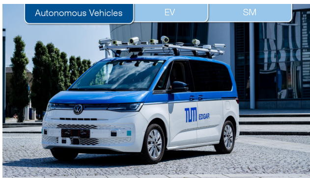
Figure 1: TUM research vehicle EDGAR.

This project gives master students the exclusive opportunity to work on real-world problems with real-world autonomous driving codes deployed on a real vehicle. The focus is purely practical and a passion for learning to deal with industry-grade software and project complexity is a must-have.