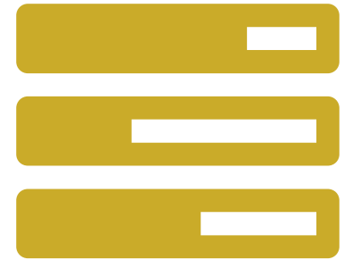
Conclusion & Future Works