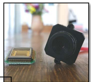
Figure 1 DVS

Lehrstuhl für Echtzeitsysteme und Robotik